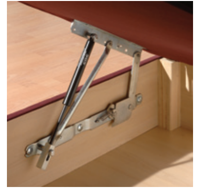
Gas strut and hinge.

Standard size options are 2'6", 3'0", 3'6", 4'0" and 4'6" (all 6'3" long) plus 5'0" and 6'0" (6'6" long). Other non standard sizes, including different depths, are available upon request.