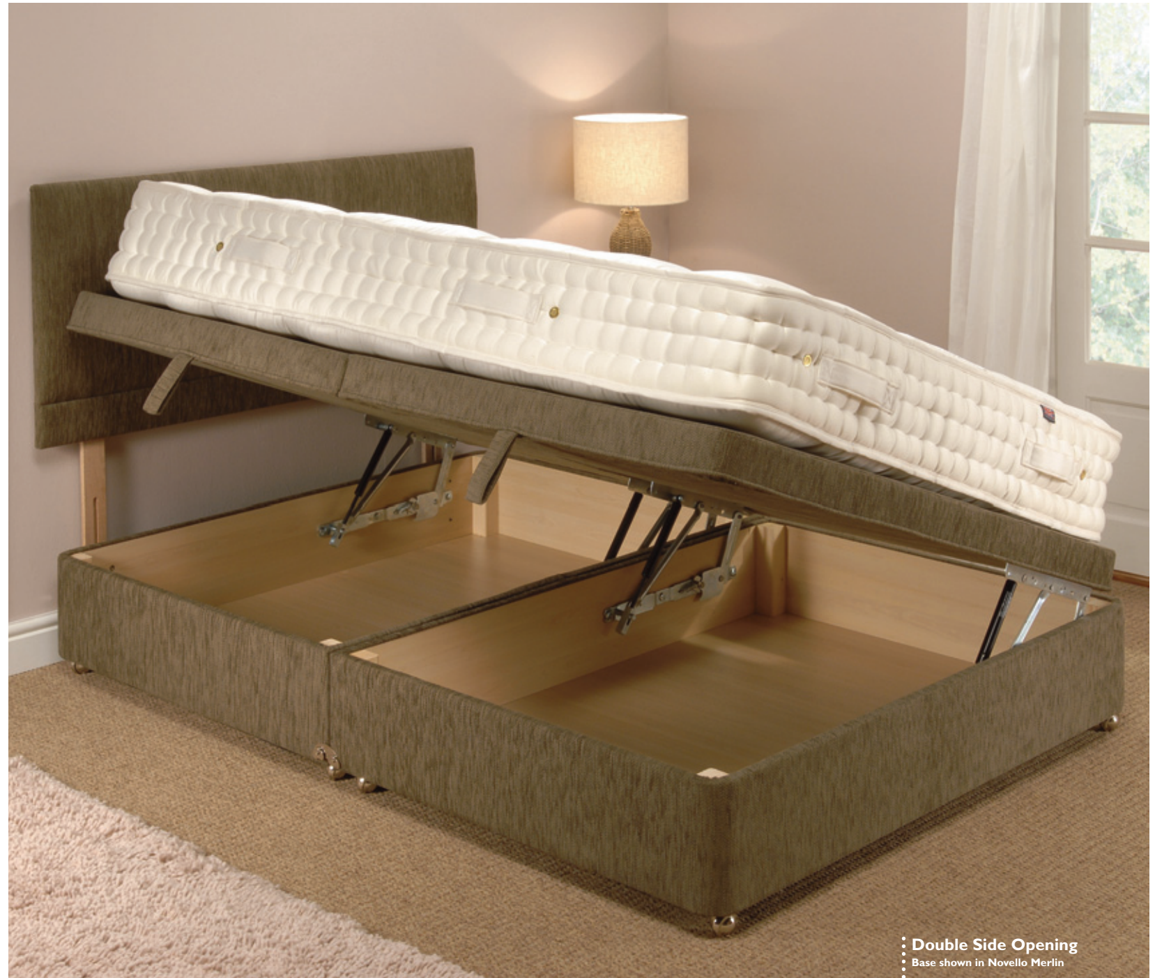
• Double Side Opening • Base shown in Novello Merlin