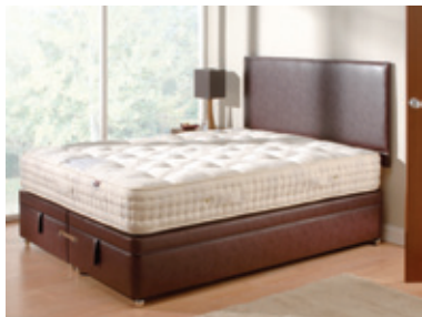
• Double End Opening • Base shown in Faux Leather Regal